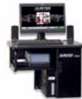
Wall-mount console WA453JLR (24")

Remote Indicator sold separately. For product dimensions, weights and site requirements, please contact your local Hunter Sales Representative.