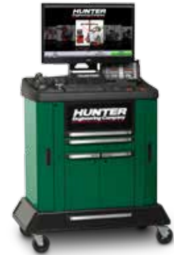
Large console WA483JLR (24") WA484JLR (27") WA485JLR (32")