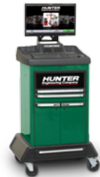
Compact console WA473JLR (24") WA474JLR (27")